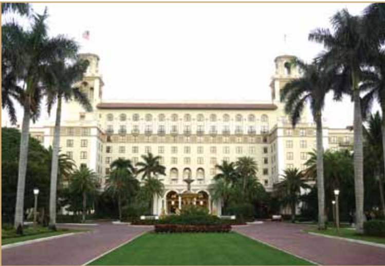
The Breakers Hotel in Palm Beach, Florida.