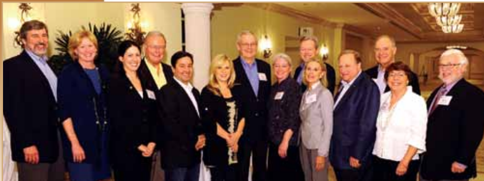
The group at the closing reception

Following the introduction of the participants and discussion of their goals for the day, the conversation turned to the ethical issues posed by the “perverse incentives” created by the Recourse Rule, which some have argued led to the 2008 mortgage crisis. The participants discussed the dilemma faced by individual executives when certain government regulations make it particularly enticing to act for short-term gain rather than in the long-term interests of their shareholders. Some participants argued that if leaders were not held accountable for these decisions, it suggests that they are